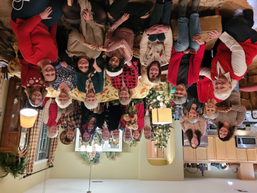
Photo: Women's Ministry Christmas dinner and ornament exchange