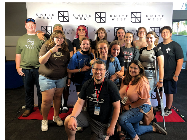
ROOTED High Schoolers at Unite- West with Covenant Grove

A weekly Rooted parents' email is sent out every Tuesday. Want to get it? It's simple. All you have to do is go to http://eepurl.com/c_Moq1 and fill out the brief form!